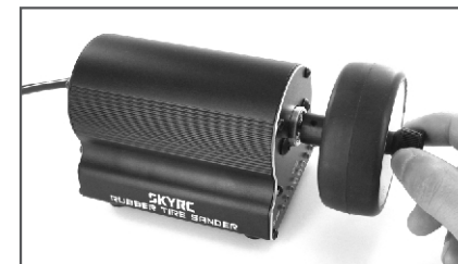
2. Put rubber tire to tire sander and tighten the thumb screw firmly