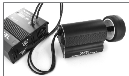
3. Connect tire sander to power supply or 2S LiPo battery