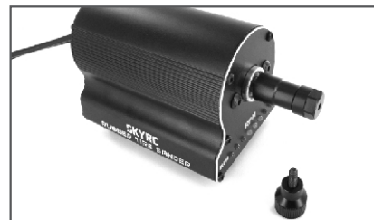
1. Remove thumb screw