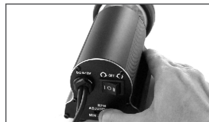
5. Adjust RPM knob if necessary